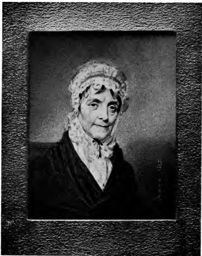
Mrs. Alexander Hamilton